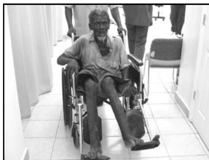
Patient with Lymphatic Filariasis

echo cardiogram, and the results of this exam will be taken to a cardiologist in the U.S. Once Visitation Hospital is completed, patients such as this will be helped without having to wait months or years for visas to be approved. Visitation Hospital Foundation is partnering with the International Children's Heart Foundation (ICHF) in Memphis to provide pediatric cardiovascular surgery. An ICHF team will travel to Haiti and treat between 125-150 patients per year.