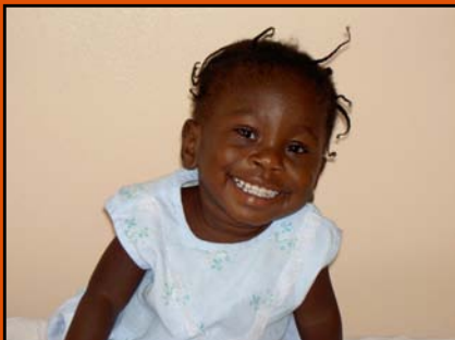
Stories from the clinic. (see p. 3)