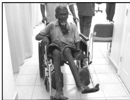
Patient with Lymphatic Filariasis

echo cardiogram, and the results of this exam will be taken to a cardiologist in the U.S. Once Visitation Hospital is completed, patients such as this will be helped without having to wait months or years for visas to be approved. Visitation Hospital Foundation is partnering with the International Children's Heart Foundation (ICHF) in Memphis to provide pediatric cardiovascular surgery. An ICHF team will travel to Haiti and treat between 125-150 patients per year.